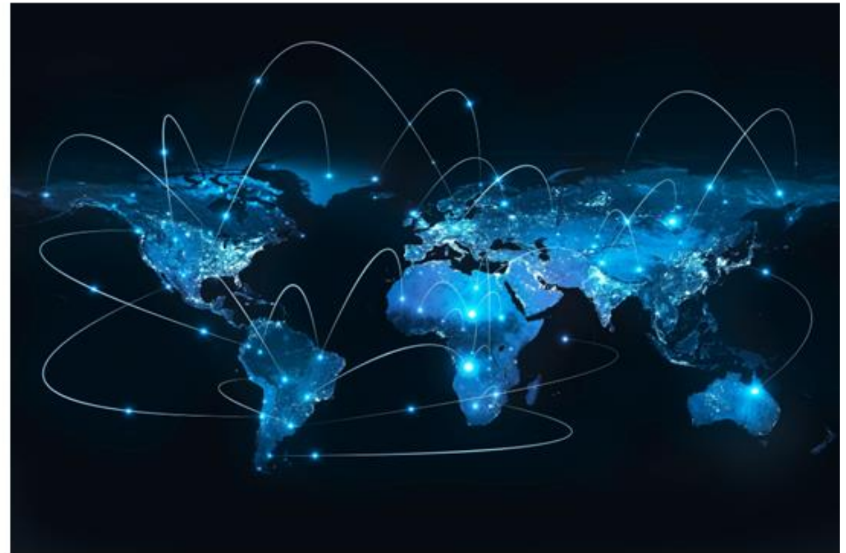
European Interoperability Framework